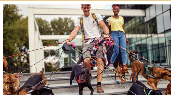
that employers had allowed minors to operate dangerous machinery and committed other violations.

The WHD news release reveals the results of three specific investigations. In them, the government found